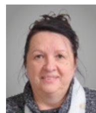
YANYA UKRAINE TEAM