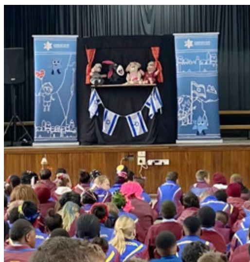
Top and bottom left: Passover food parcel project. Bottom right: Puppet show in a school in South Africa.