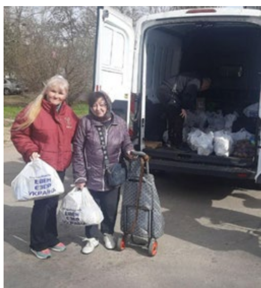
Top and bottom: Team handing out humanitarian aid in Ukraine.